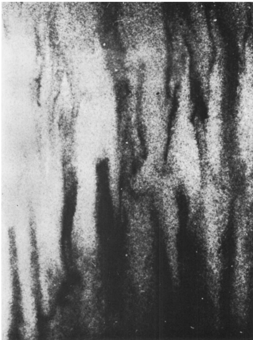
FIGURE 2. Photograph of heavy-heavy system I (equisize particles of different densities) taken 20 s after cessation of mixing. Frame width is 115 mm and PVC particles (less-dense phase) are dyed.

rapidity, and sedimentation returns to normality only when the two types of particles find themselves present alone once again.